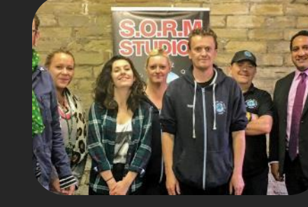
Venue / Festival