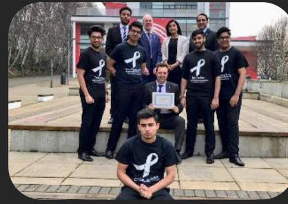
College / University