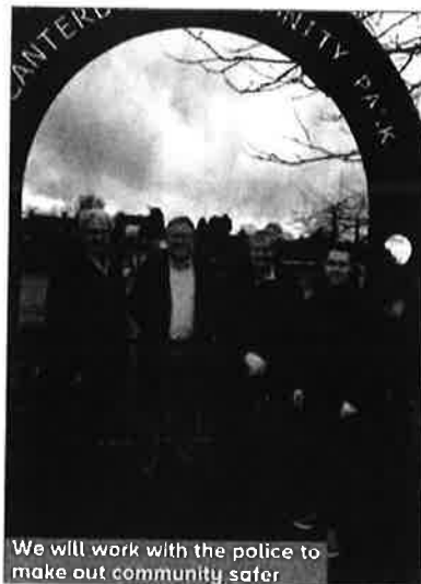
We will work with the police to make our community safer

In most cases we hope that making those responsible aware of the effects of their behaviour will help to reduce anti-social behavior. But for those that refuse to accept their actions are spoiling our community we need strong action to make Winshill safe.