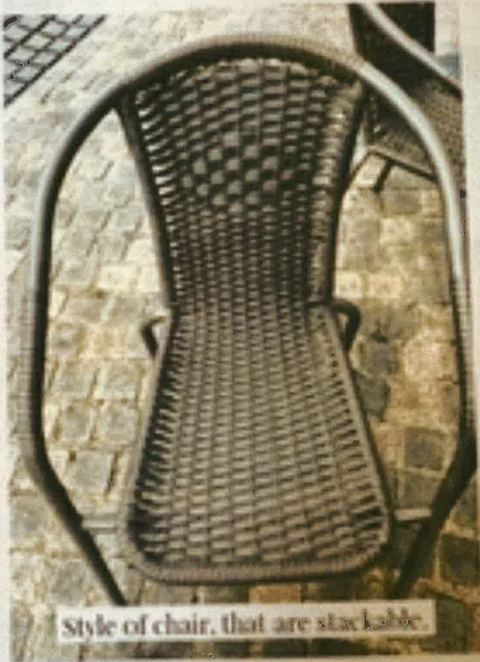
style of chair, that are stackable.