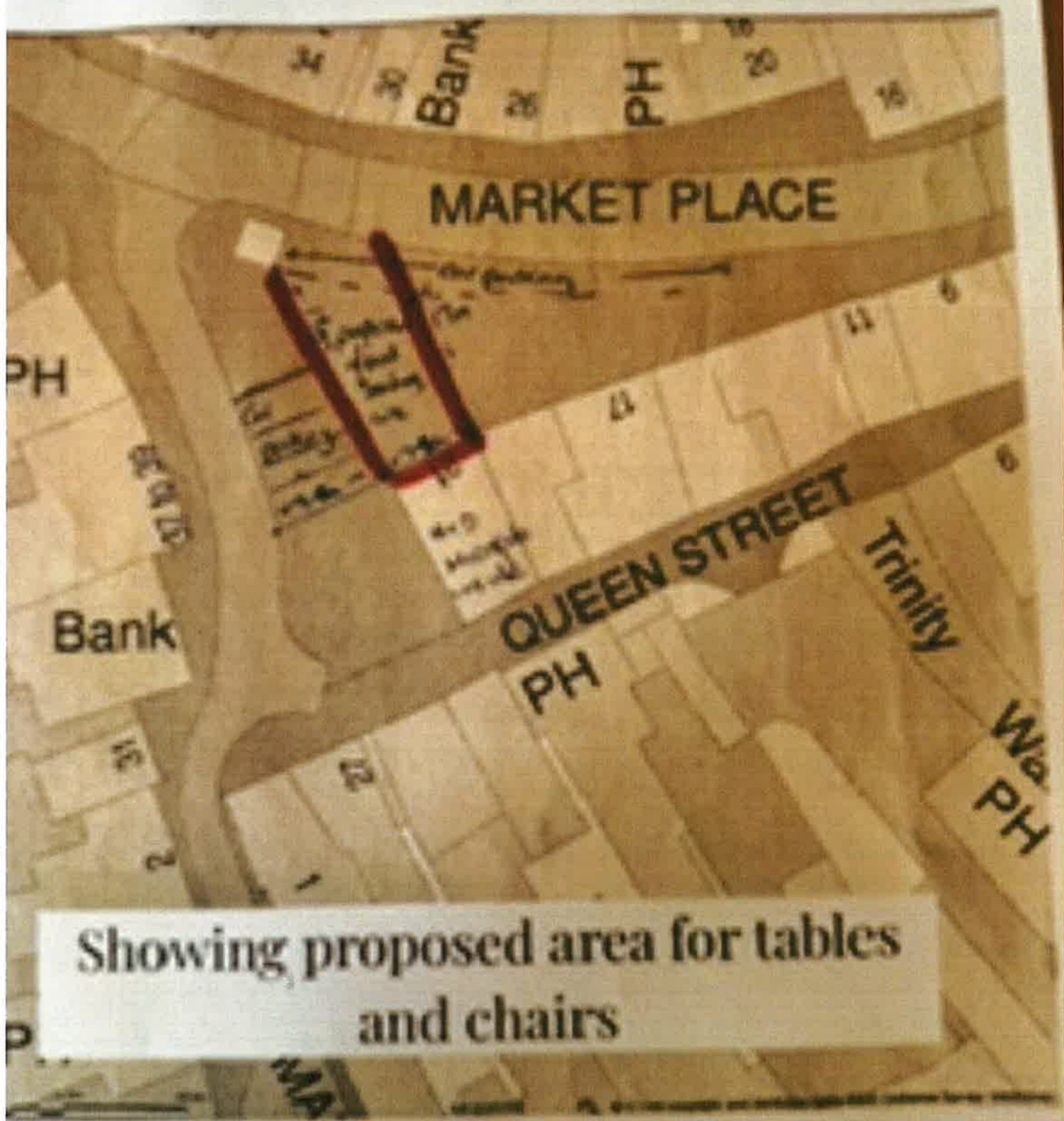
Showing proposed area for tables and chairs