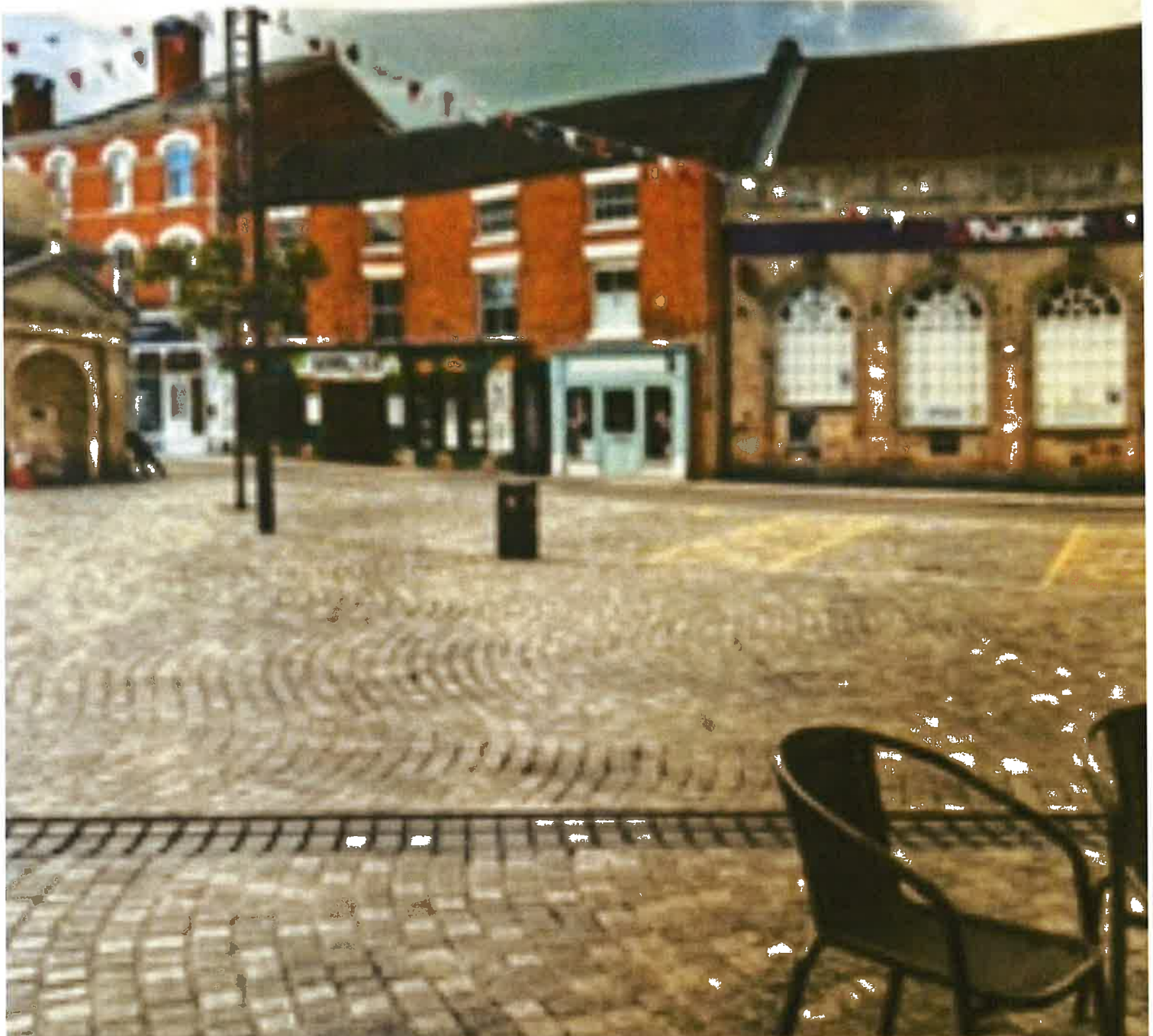
View from property entrance showing extent of proposed table and seating and car parking bays