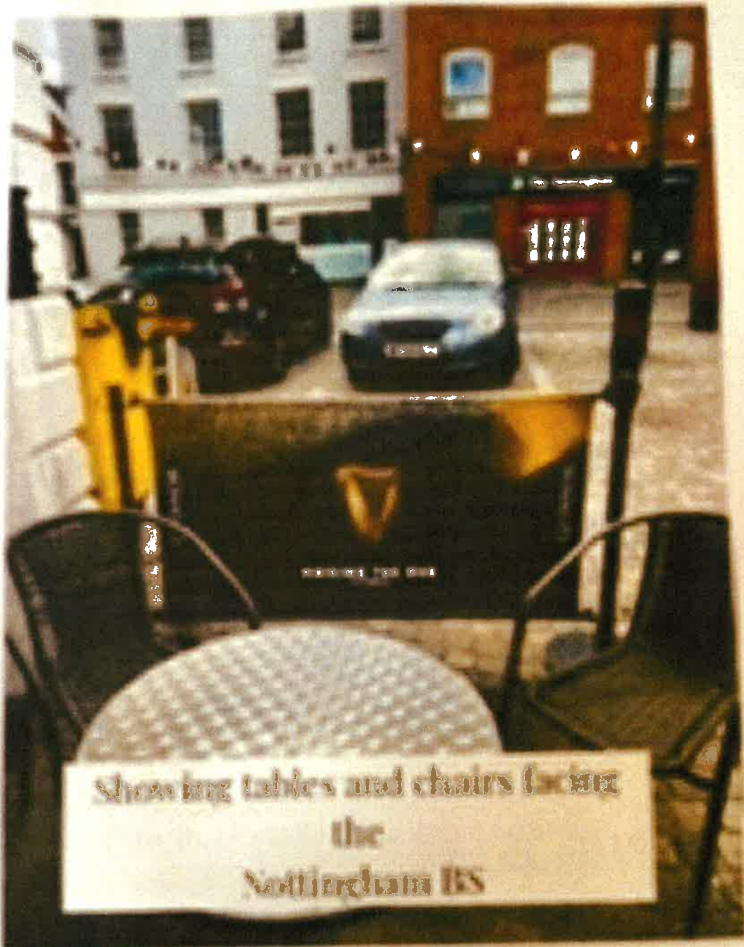
Showing tables and chairs for use the Nottingham BS