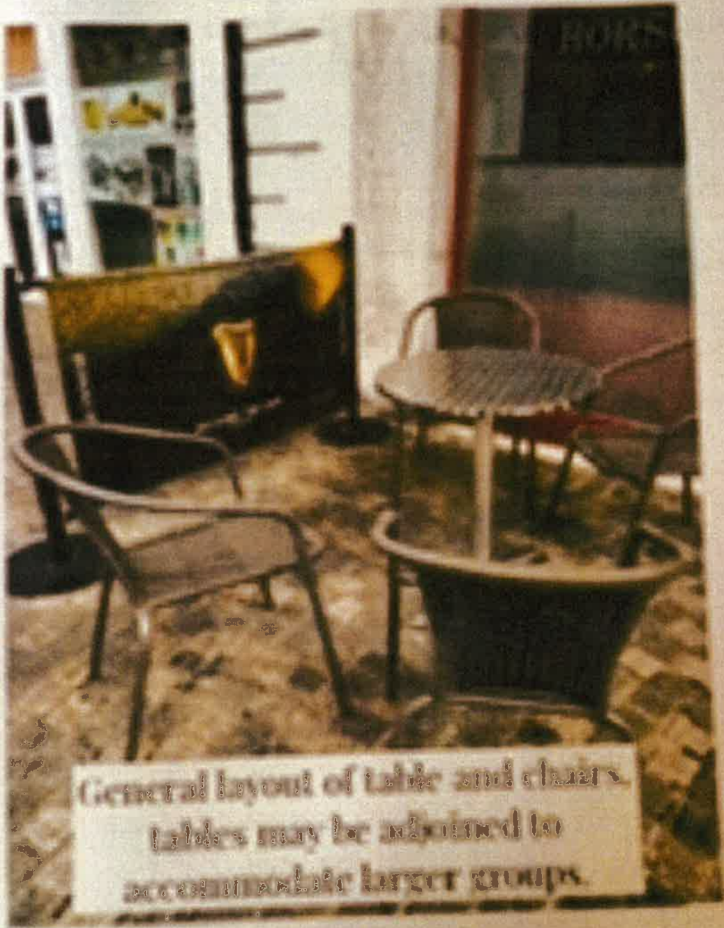
General layout of table and chairs. Tables may be adjusted to accommodate larger groups.