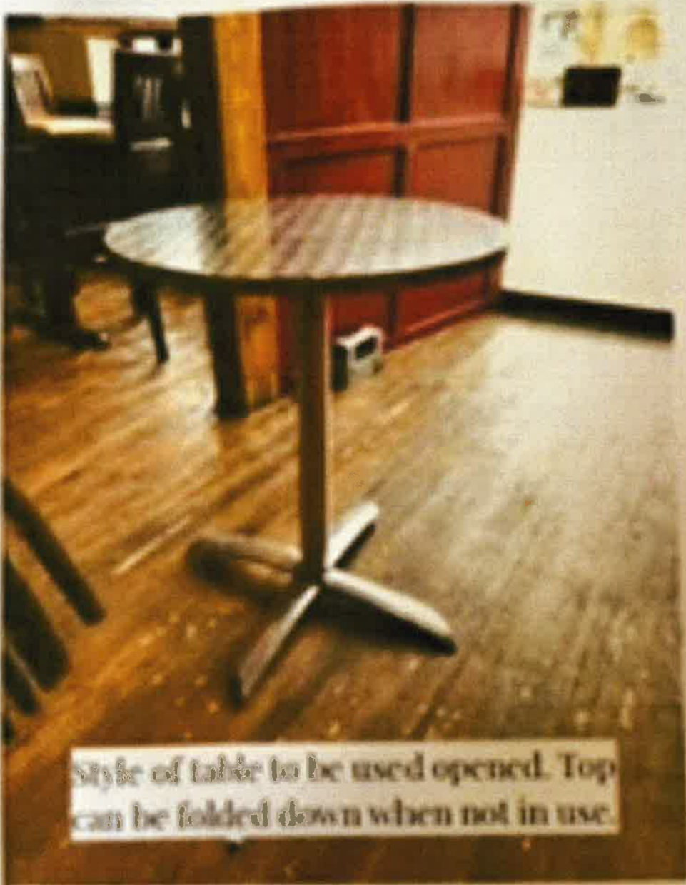
Style of table to be used opened. Top can be folded down when not in use.